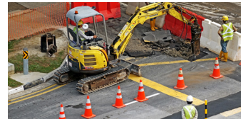
ON THE JOB TRAINING