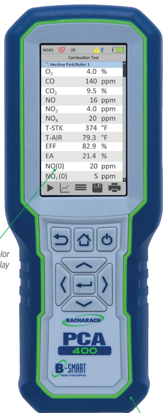
Large color touch display

For Commercial and Industrial Applications