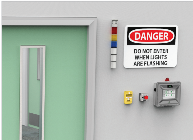
Remote Display located outside of mechanical room provides entry way signaling